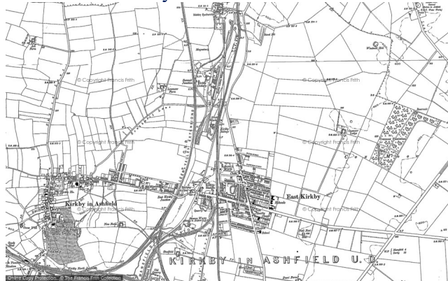
Kirkby in Ashfield C 1914